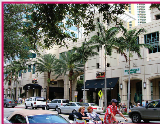
Las Olas Boulevard, Fort Lauderdale

Liberty House 504-508 SE 22nd Street Ft. Lauderdale, FL 33316