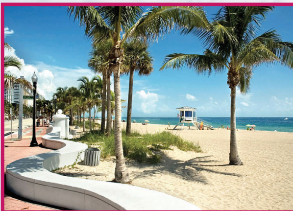
Beautiful Fort Lauderdale Beach